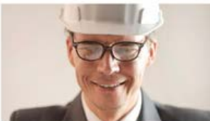
Leadership in Safety (LSE)