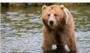
Wilderness & Bear Awareness