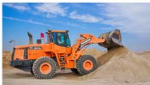
Ground Disturbance 201