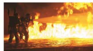
Firefighting & Fire Extinguisher