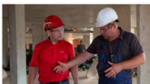
Behavior Based Safety (BBS)