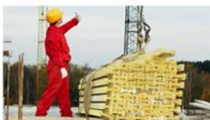
Rigging and Slings (Advanced)