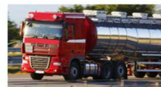
Transportation of Dangerous Goods (TDG)