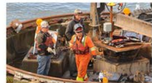
Confined Space Entry & Monitor