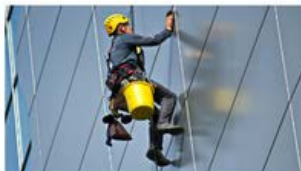
Fall Protection (Alberta)