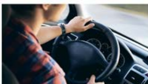
Defensive Driving – 3 Demerit Reduction